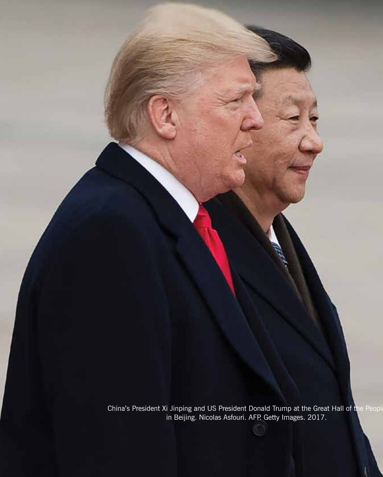
China's President Xi Jinping and US President Donald Trump at the Great Hall of the People in Beijing.

AN ADDRESS TO THE ASIA SOCIETY NEW YORK CITY DECEMBER 5, 2018